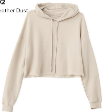
7502 in Heather Dust