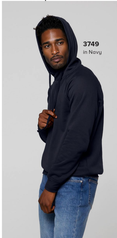
3749 in Navy