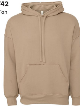
3742 in Tan