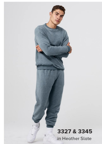
3327 & 3345 in Heather Slate