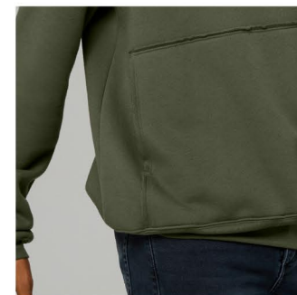
3743 in Military Green