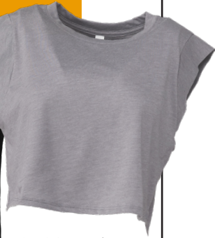
8483 festival cropped tank