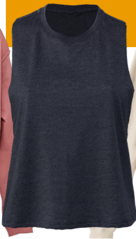
6682 raceback cropped tank