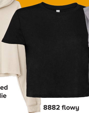
8882 flowy cropped tee