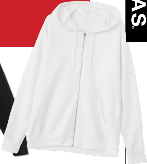
3739 full-zip fleece hoodie