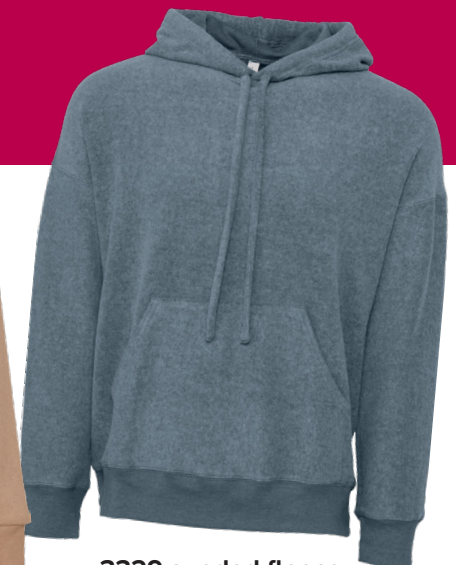
3329 sueded fleece pullover hoodie