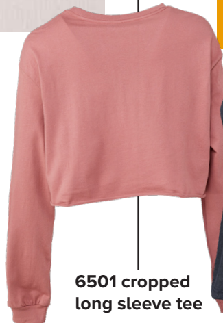
6501 cropped long sleeve tee