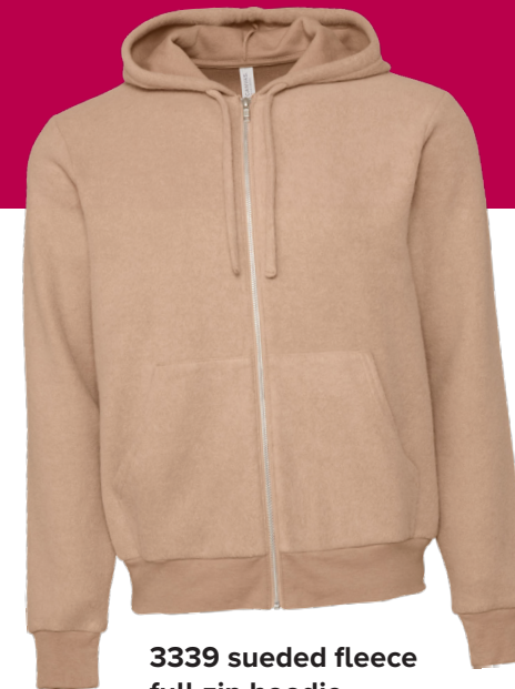
3339 sueded fleece full-zip hoodie