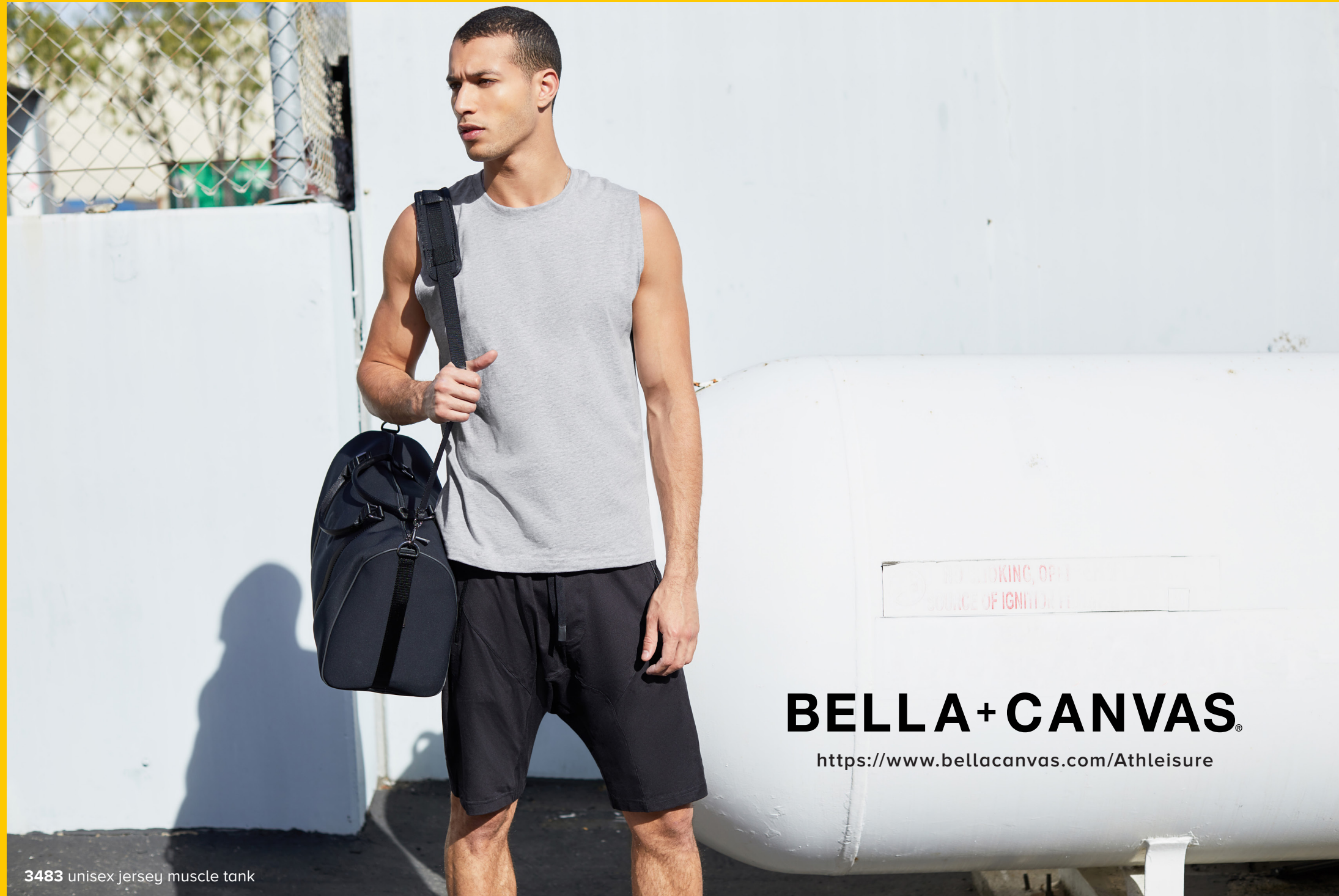
3483 unisex jersey muscle tank