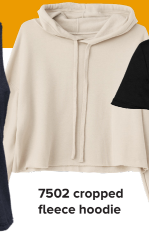
7502 cropped fleece hoodie