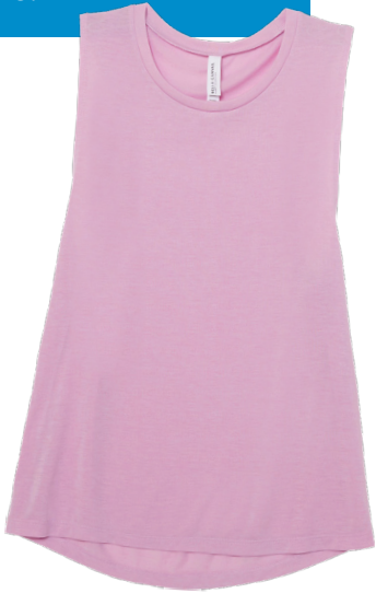
8803 flowy scoop muscle tank