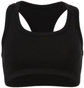
0970 nylon spandex sports bra