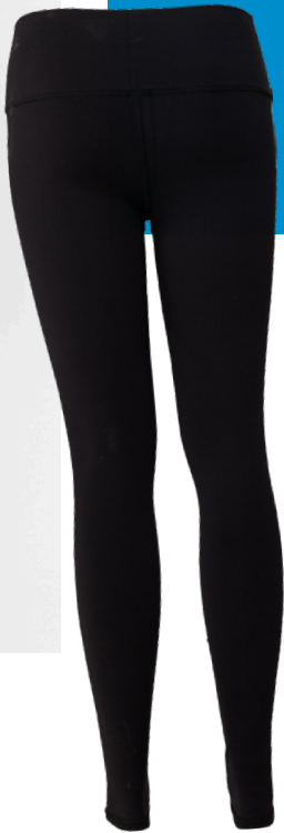
0813 high-waist fitness leggings

03 Women’s Flowy Scoop Muscle Tank (8803) Loose-fitting and delightfully drapey, this super-soft poly/viscose top caresses curves. It’s a more feminine version of our men’s muscle shirt, versatile for on-the-go women who don’t need to sacrifice style for comfort. Layer under a cardigan or blazer for a professional look; switch to active mode in seconds by throwing on a hoodie.