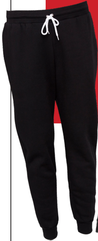
3727 jogger sweatpants