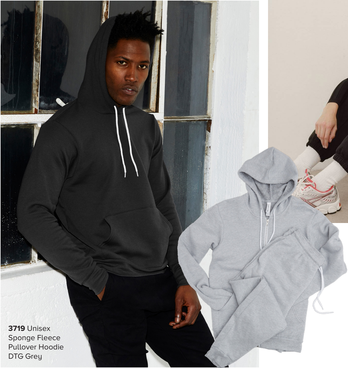
3719 Unisex Sponge Fleece Pullover Hoodie DTG Grey

Style Tips: Pair your sweatsuit with white tube socks for a vintage vibe (or go heather grey for a sportier look). You can also dress up your sweatsuit with structured blazers and sneaks, or chunky knits and boots.