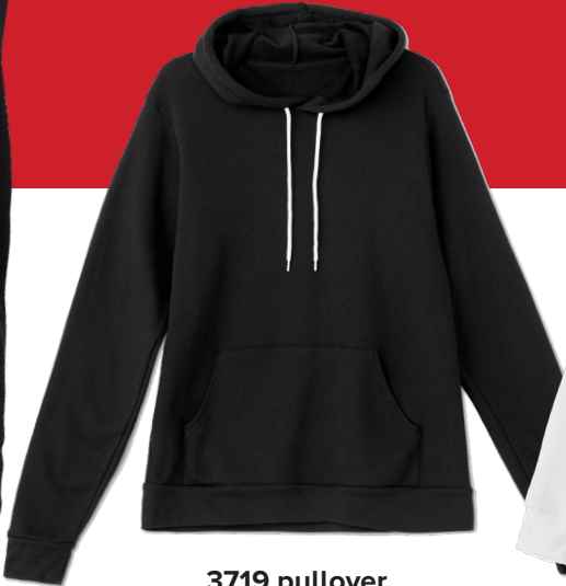
3719 pullover fleece hoodie