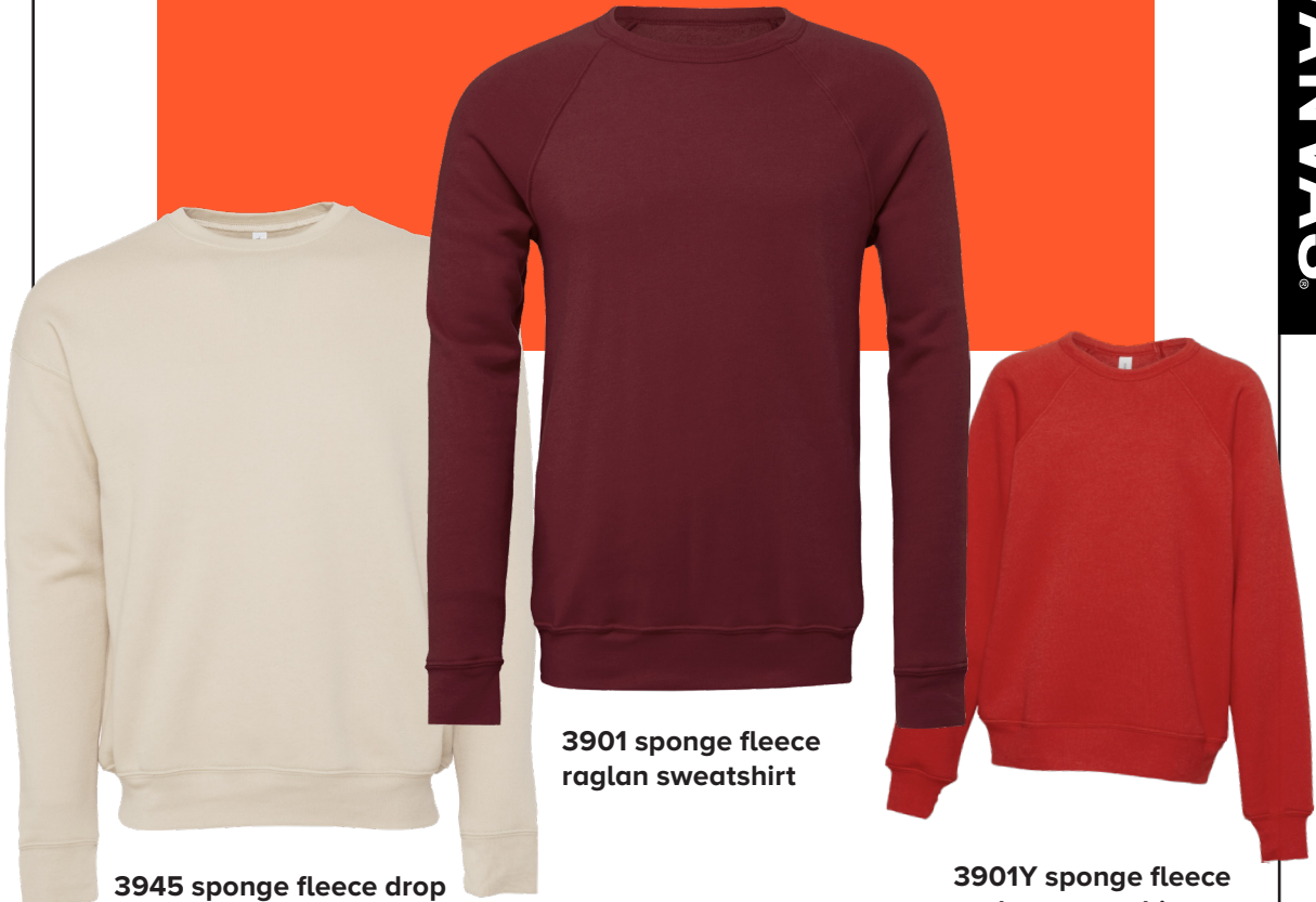
3945 sponge fleece drop shoulder sweatshirt

03 Youth Sponge Fleece Raglan Sweatshirt (3901Y) Our remarkably soft pullover comes in youth sizes, too! The perfect grab-and-go option for active kids, they can wear these styles everyday.