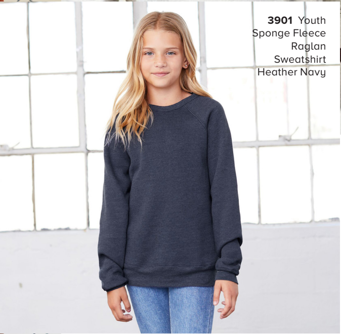
3901 Youth Sponge Fleece Raglan Sweatshirt Heather Navy