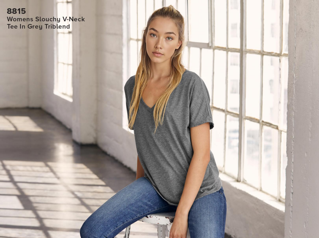
8815 Womens Slouchy V-Neck Tee In Grey Triblend