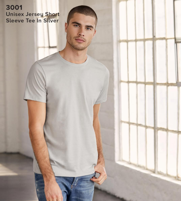
3001 Unisex Jersey Short Sleeve Tee In Silver