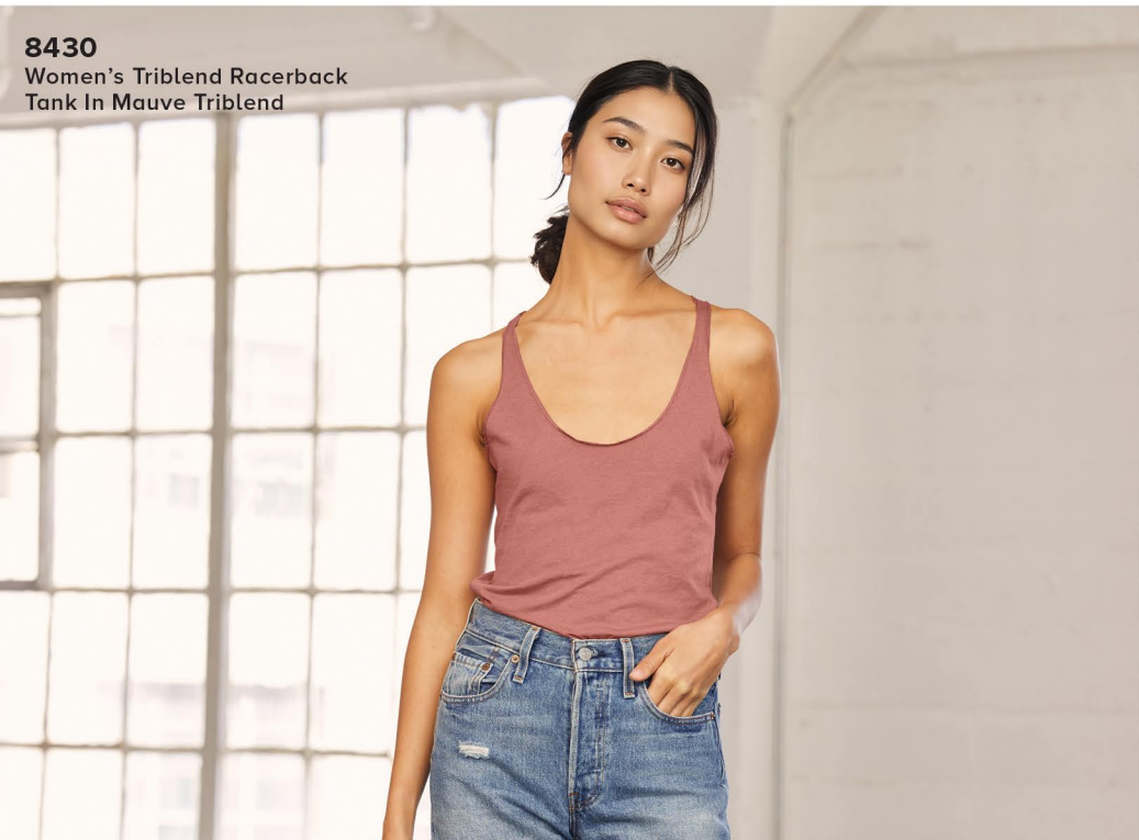
8430 Women's Triblend Racerback Tank In Mauve Triblend