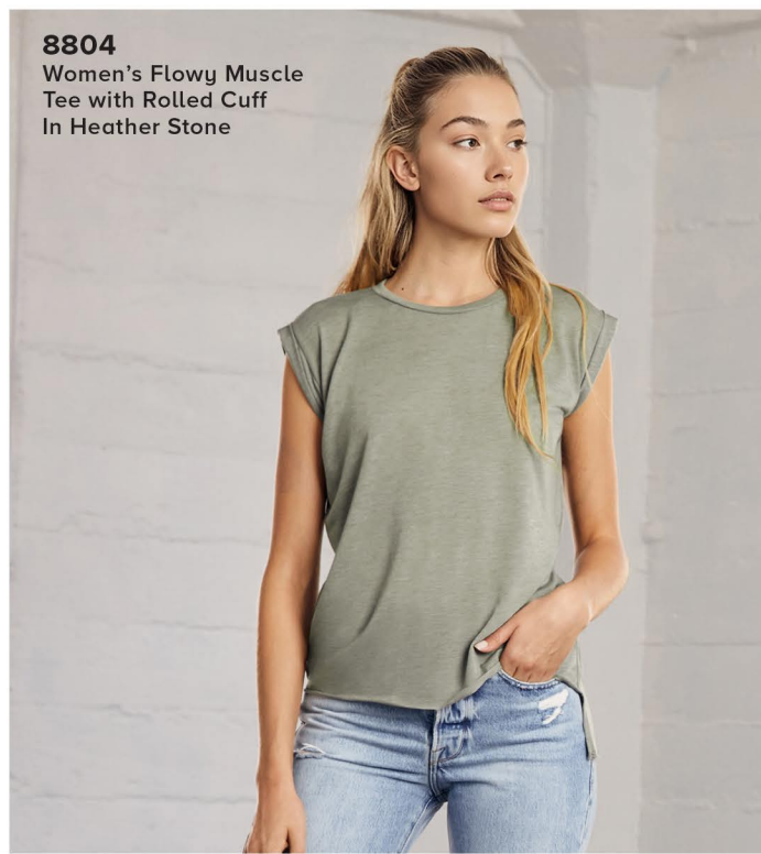
8804 Women's Flowy Muscle Tee with Rolled Cuff In Heather Stone