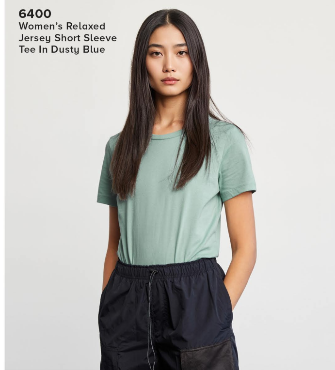
6400 Women's Relaxed Jersey Short Sleeve Tee In Dusty Blue