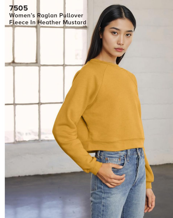
7505 Women's Raglan Pullover Fleece In Heather Mustard