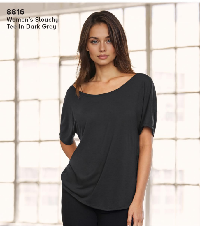
8816 Women's Slouchy Tee In Dark Grey