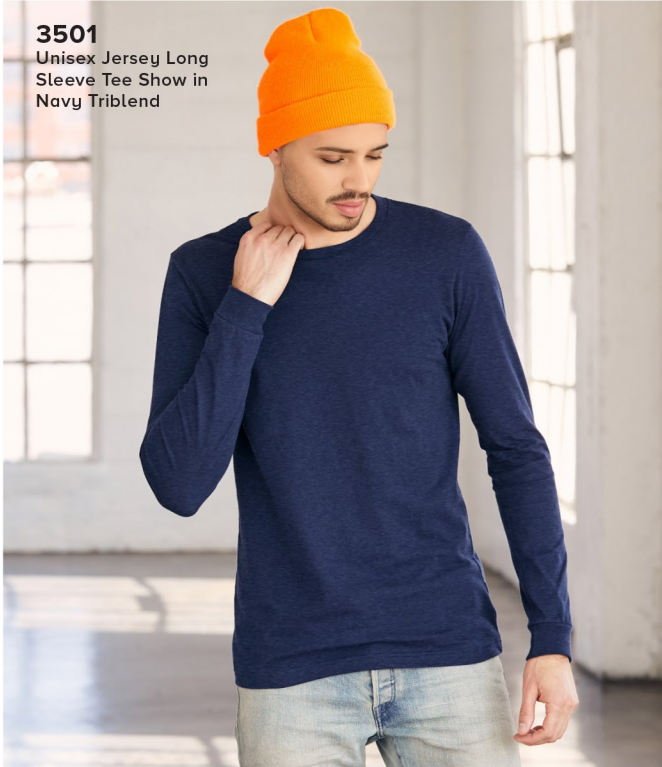
3501 Unisex Jersey Long Sleeve Tee Shown in Navy Triblend