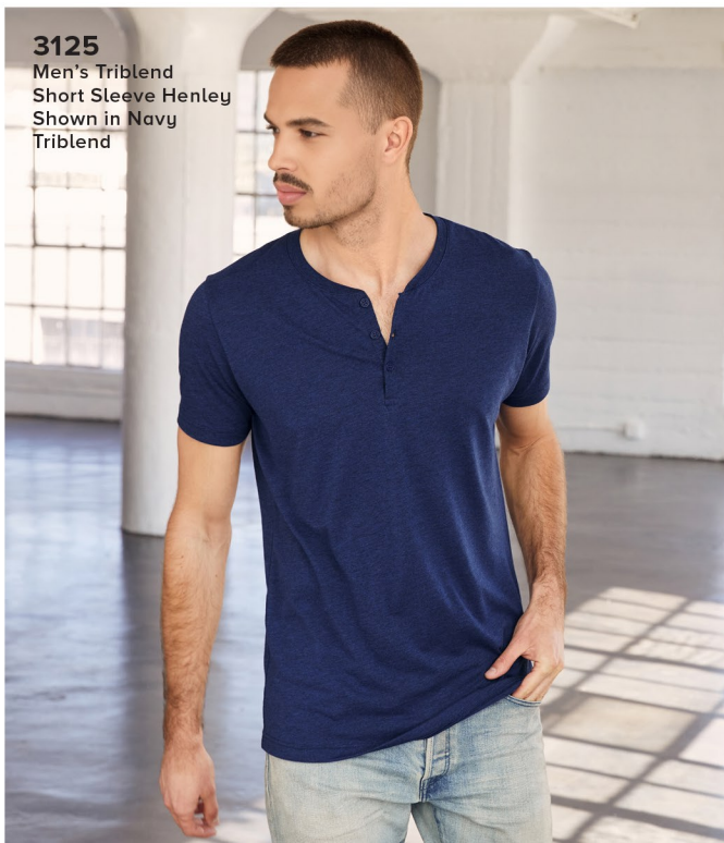
3125 Men's Triblend Short Sleeve Henley Shown in Navy Triblend