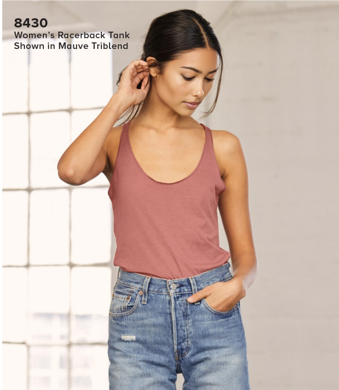
8430 Women's Racerback Tank Shown in Mauve Triblend