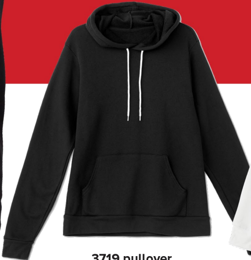
3719 pullover fleece hoodie