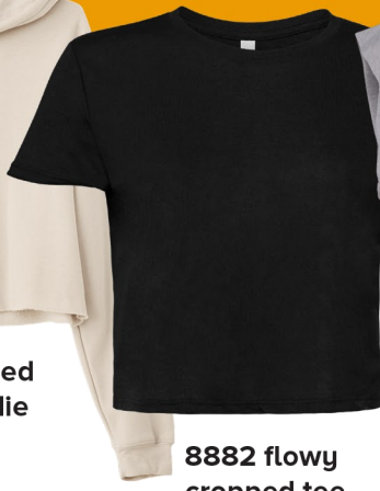
8882 flowy cropped tee