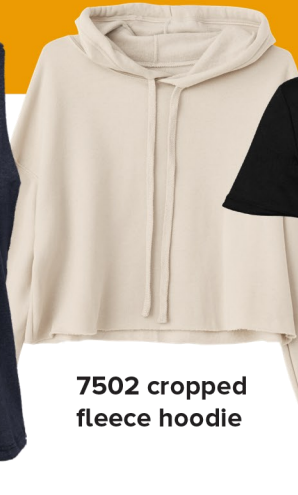
7502 cropped fleece hoodie