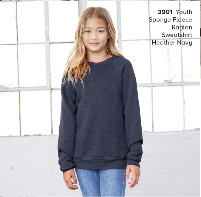
3901 Youth Sponge Fleece Raglan Sweatshirt Heather Navy