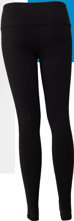
0813 high-waist fitness leggings

03 Women’s Flowy Scoop Muscle Tank (8803) Loose-fitting and delightfully drapey, this super-soft poly/viscose top caresses curves. It’s a more feminine version of our men’s muscle shirt, versatile for on-the-go women who don’t need to sacrifice style for comfort. Layer under a cardigan or blazer for a professional look; switch to active mode in seconds by throwing on a hoodie.