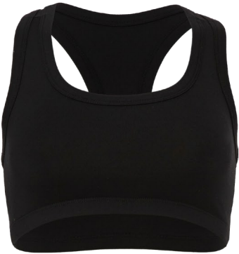
0970 nylon spandex sports bra