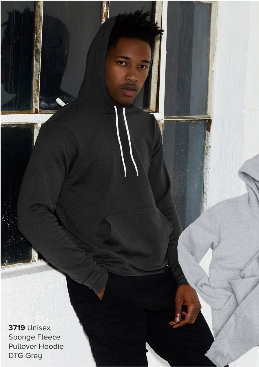
3719 Unisex Sponge Fleece Pullover Hoodie DTG Grey