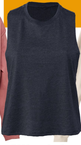
6682 raceback cropped tank